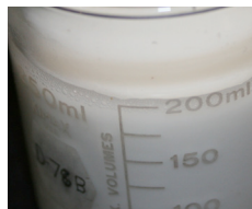
D-78B developer solution

After parts have been dipped into the developer, put them immediately into the dryer. Allowing part to remain in the wet developer, or to sit while wet for a period of time before drying can cause the penetrant to bleed from the defects, resulting in dim blurry indications. Immediate drying produces the best results. The dryer temperature should be set at the maximum allowable temperature of 160°F(71°C). If the surface of the part looks bluish under ultra violet light (UV-A) , or pinkish it is an indication that the parts have been in the developer bath too long and the bath is becoming contaminated with penetrant.