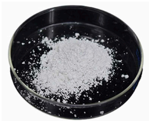
D-78B developer powder

After parts have been dipped into the developer, put them immediately into the dryer. Allowing part to remain in the wet developer, or to sit while wet for a period of time before drying can cause the penetrant to bleed from the defects, resulting in dim blurry indications. Immediate drying produces the best results. The dryer temperature should be set at the maximum allowable temperature of 160°F(71°C). If the surface of the part looks bluish under ultra violet light (UV-A) , or pinkish it is an indication that the parts have been in the developer bath too long and the bath is becoming contaminated with penetrant.