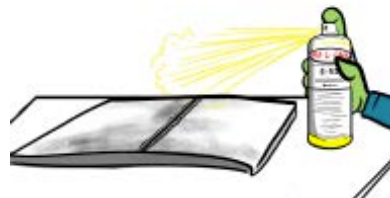
E-59A used as a pre-cleaner spray directly on test surface and wipe clean.

7. For fluorescent Type 1 penetrants use UV-A illumination of >1000 μw/cm 2 @ 15inches (38.1 cm) in a darkened area of <21 lux visible light (<2 footcandles). For visible Type 2 penetrants use lighting of 1100 lux/m 2 (100 footcandles) minimum.